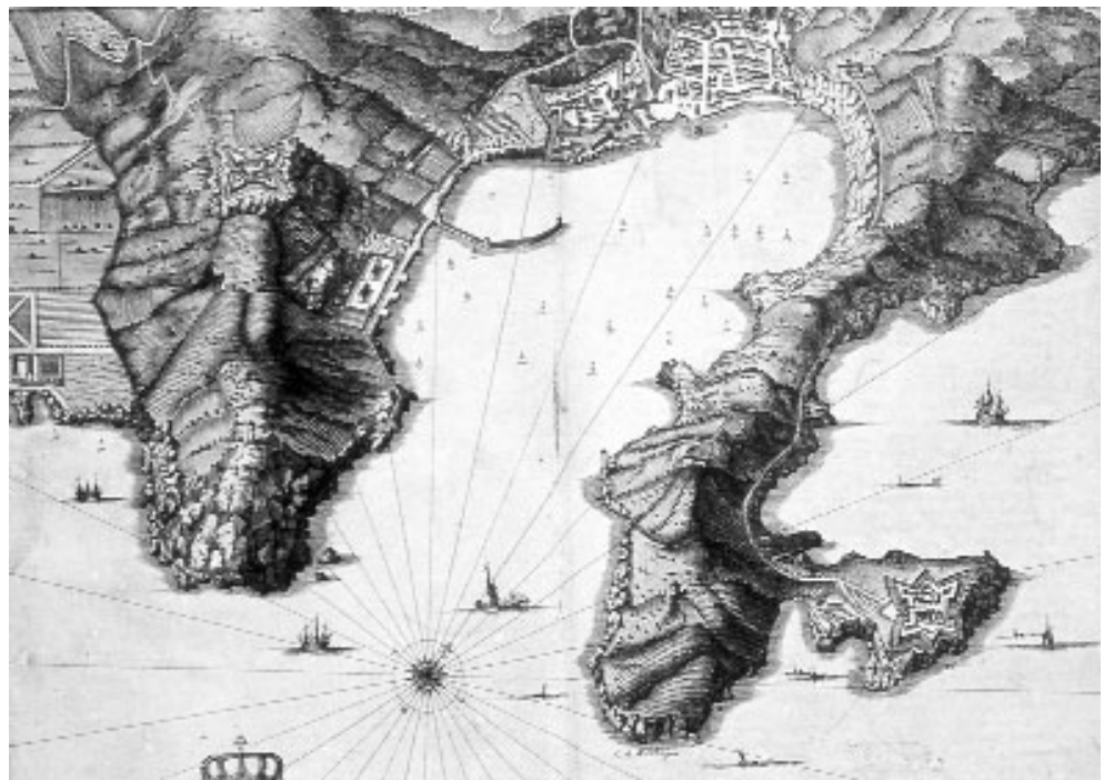
FIG. 5 - Historical map of Villefranche sur Mer (Côte d'Azur, France) (after Vigne, 1998).

In conclusion, what should be emphasized, since it summarises the spirit leading investigations in this field, is the fact that research approaches of an integrated, systemic type can become a very important opportunity for Geomorphology. Indeed, this Earth discipline can find in these new topics further possibilities of development with new cultural and social vocations.