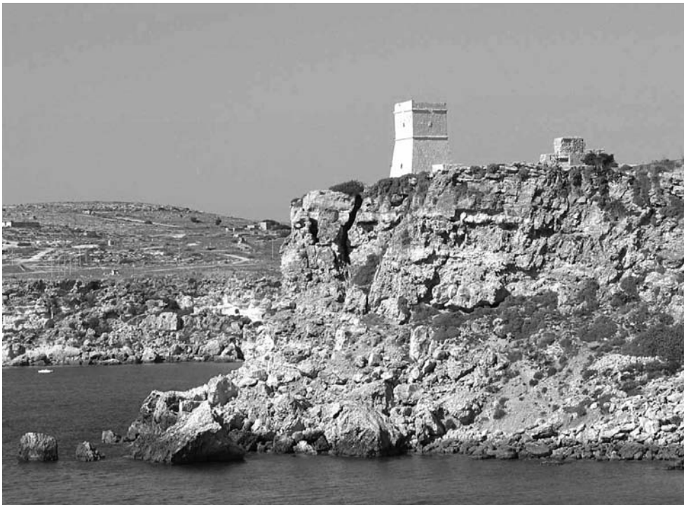
FIG. 4 - The 1637 coastal tower at Ghajan Tuffieha Bay (NW Malta) at risk due to the retreating cliff (Magri & alii , 2007).

In the fifth phase one should consider that the correct management of a cultural asset cannot be separated from the knowledge of its integration with the surrounding environment (Panizza & Piacente, 1991, 2003). In this way the right fruition can be promoted, with positive spin-offs in socioeconomic terms, also for what concerns conservation and improvement. Such an operation, together with all initiatives and activities aiming to promote and protect assets, must necessarily be implemented by means of inter-