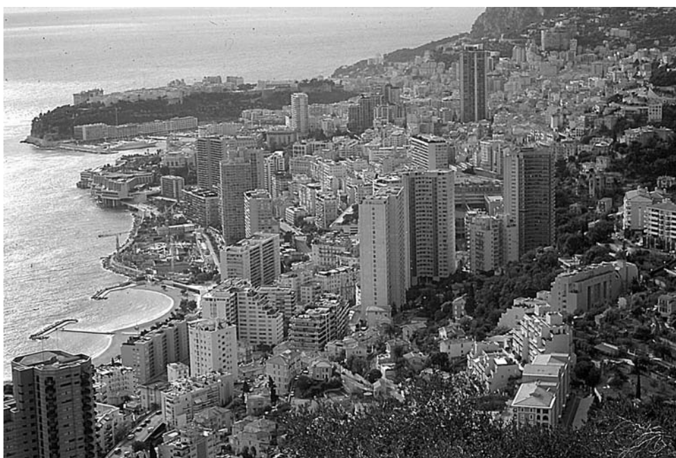
FIG. 2 - The coastline of Monte-carlo intensely modified by Man.

need is felt to provide all people involved with criteria and tools for assessing landforms in the most objective way possible. Indeed, a quantitative assessment of geomorphological assets is necessary both for comparing the various sites investigated and other environmental and non-environmental assets, in order to rank and select them according to their level of importance and, above all, within the field of Territorial Planning or Environmental Impact Assessment (EIA) procedures. In these particular applications adequate strategies should be chosen and evaluation priorities decided.