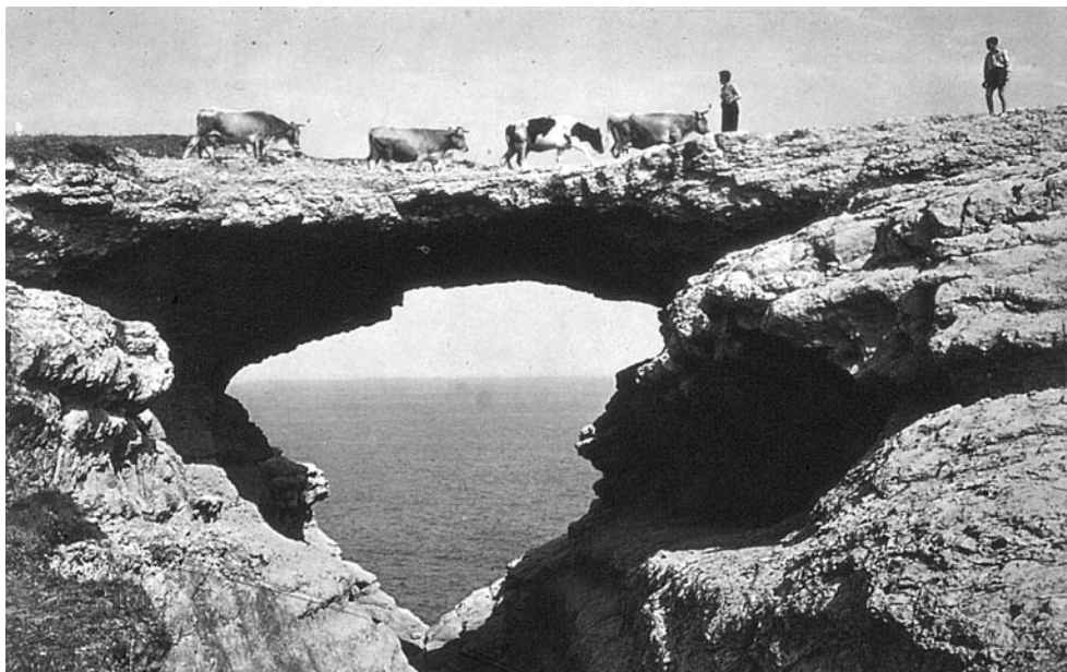
FIG. 1 - The Diablo Bridge near Santander (Spain) from a historical postcard. This is an example of risk and/or impact (Panizza, 1996). If we consider this natural bridge as a source of hazard and the man with the oxen as vulnerable elements , the eventual collapse of the bridge represents a risk . If, on the contrary, we consider the natural bridge as a geomorphosite and the man with his oxen as an activity , that in the long run can cause the collapse of the bridge, then we are in the case of impact .